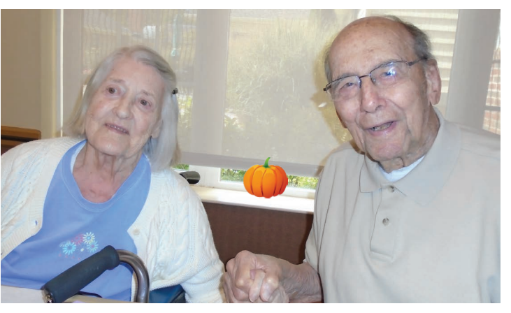
Still in love after all these years!