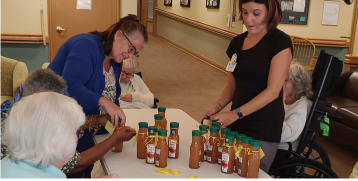
The Activities gals tie the tags on the bottles