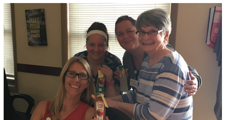
Kensington gals are so appreciative of Mary F's. gift