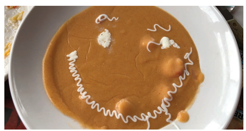
Lobster Bisque... It's the bomb!