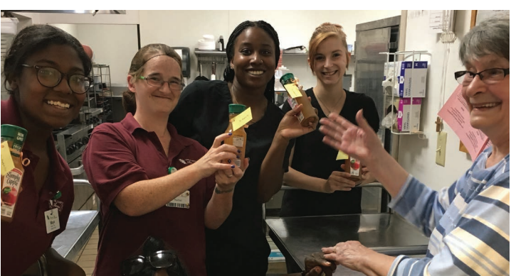
Kensington dietary staff is all smiles