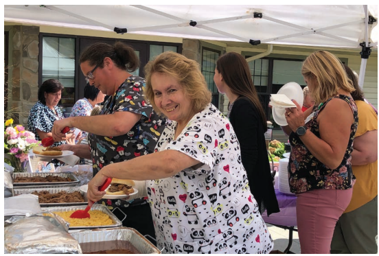
The food was fantastic