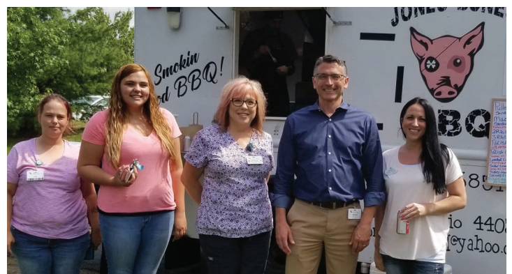
The first in line!

Pulled pork and chicken, ribs, smoky macaroni and cheese, loaded fries, coleslaw. This is what employees enjoyed when the Jones BBQ food truck swung by a few weeks ago. Really delicious food! We already reserved a date for next summer!