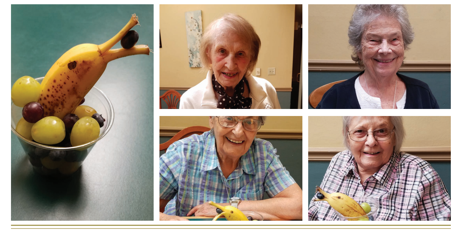
Who knew that a banana could creatively be turned into a dolphin?