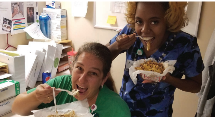
Kensington Northwest unit gals dig in!