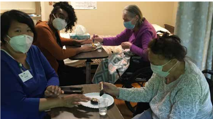
The activities group offers assistance