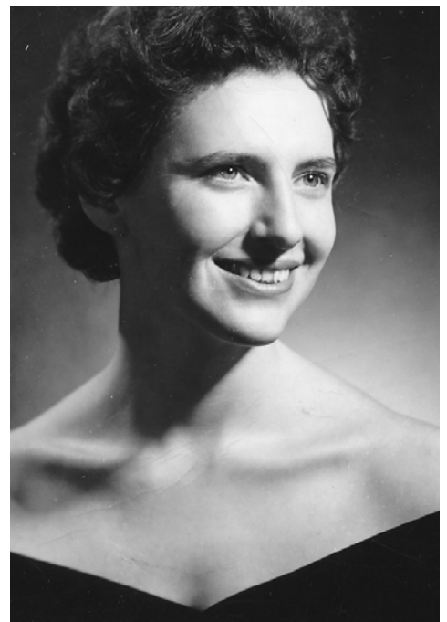
What a beauty! Homecoming Queen