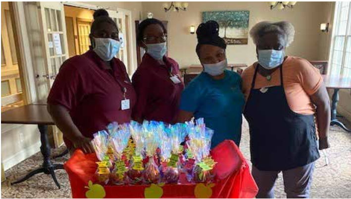
The Kensington crew gets ready to distribute

Or, as we'd like to say, Awesome to the Core! Kensington at Anna Maria residents really appreciate their care-takers, and like to show their appreciation with small "made with love" gifts. September's gift was a delicious apple with a small tub of peanut butter wrapped in cellophane with these awesome words, "Our Staff is Awesome to the Core." We do agree!