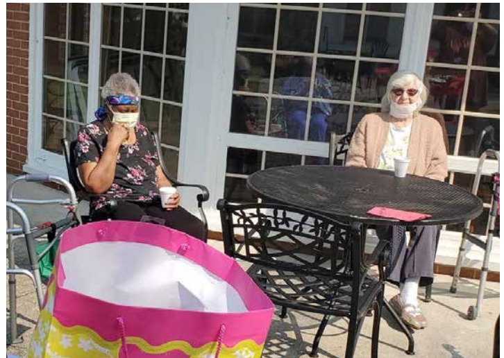
Enjoying the fresh air and sunshine

A local Girl Scout troop donated rocks lovingly painted with pretty pictures and inspirational sayings. Anna Maria residents spent a sunny afternoon outside admiring the rocks and placing them strategically on the grounds throughout the courtyard.