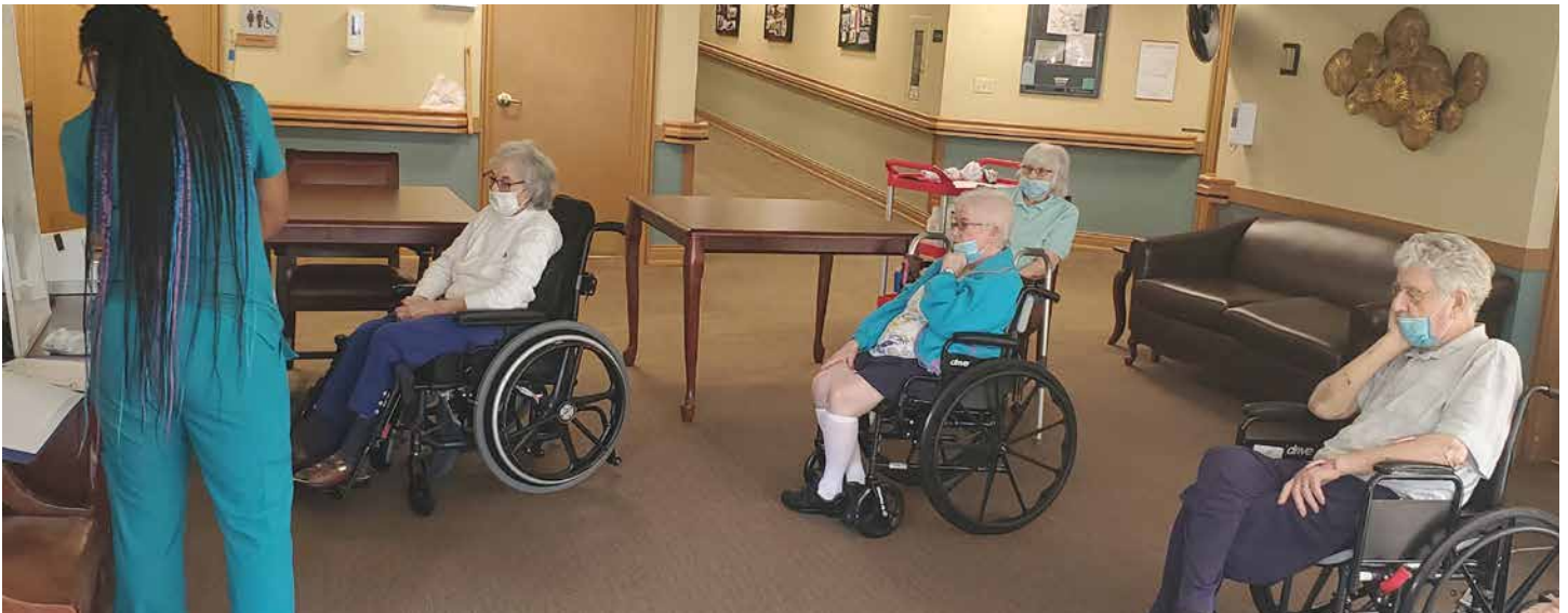
Next to Bingo, our residents enjoy a good game of Hangman. Always lots of fun figuring out the mystery word. Not as easy as it seems, as our activities gals keep the residents “on their toes” with tricky words.