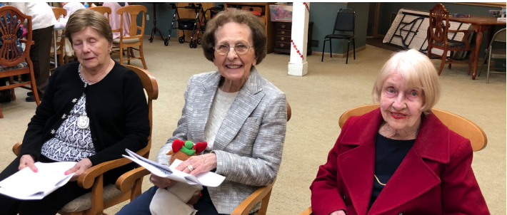
These lovely ladies chose to sing over crafting

One fine afternoon, assisted living residents had a choice of crafting a felt heart (Valentine's Day is right around the corner) or participating in a sing-a-long. The group definitely split evenly in half and worked out so nice, as the lovely singing helped the crafters craft just a bit better!