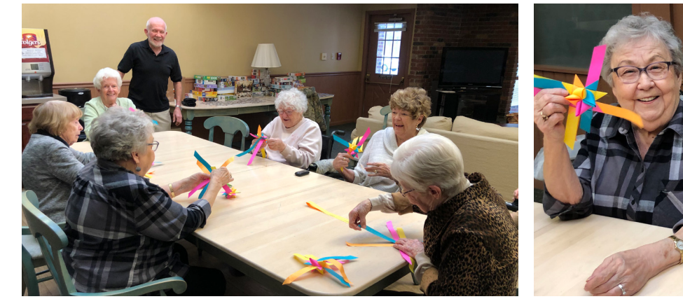
The group gives it a try