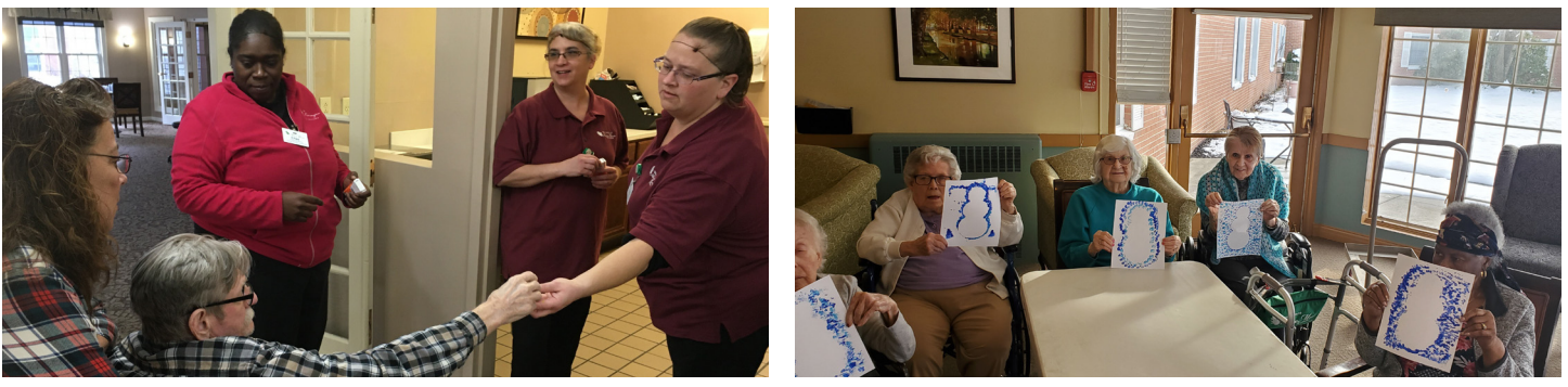
The painted snowmen! So cute!

Should we be happy or sad about the lack of snow received so far this winter season? Since we can't build a snowman outside, we can certainly paint one inside, and that's exactly what Anna Maria residents did one sunny afternoon. *** The snowman was also the "main attraction" of the January employee trinket. Each month, residents craft a little something to distribute to employees as a "thank you" for all of their hard work. January's trinket was a string cheese snowman and a boxful of snowman noses (Tic Tacs). Best thing about all of these snowmen? They won't melt!