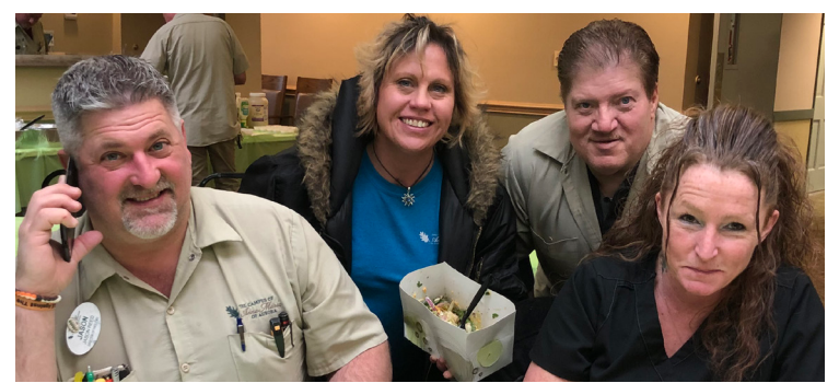
These employees all agree: Very tasty and delicious