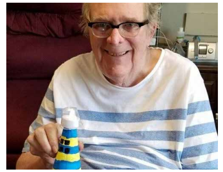
Blue and yellow – great colors for a lighthouse