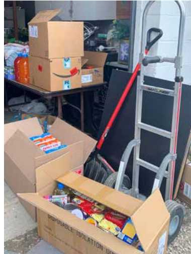
Took a couple of trips to drop off canned goods