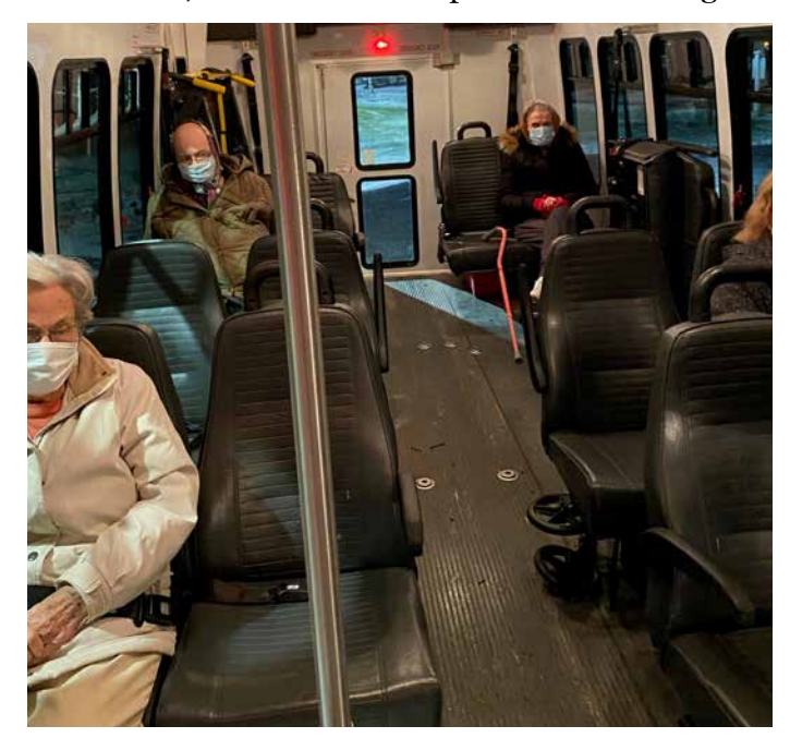
One day we hope the bus will be filled again... Until then, four people max

ne of the highlights our assisted and independent living residents enjoy during the holiday season is a bus ride to view beautiful Christmas lights. Normally our bus can comfortably accommodate 14 residents, however, with social distancing, four is max. So the solution is not one, but four bus trips to view the lights.