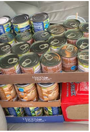
Lots of canned mushrooms