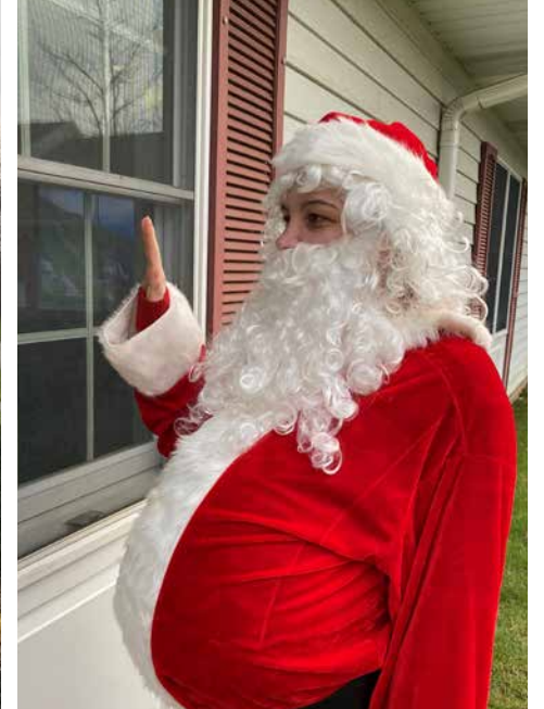
Ho, Ho, Ho says Santa - Have you been good?