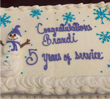
What a beautiful cake!