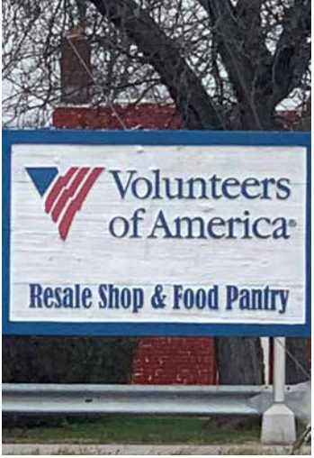
Volunteers of America