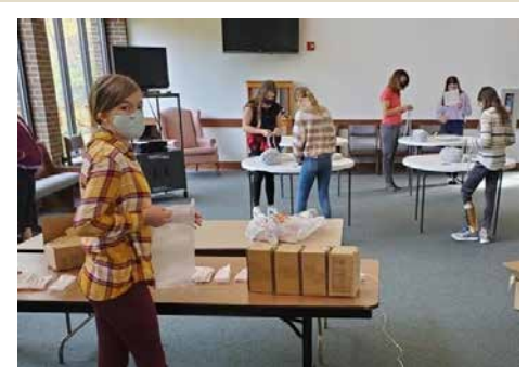
Made with love for sure