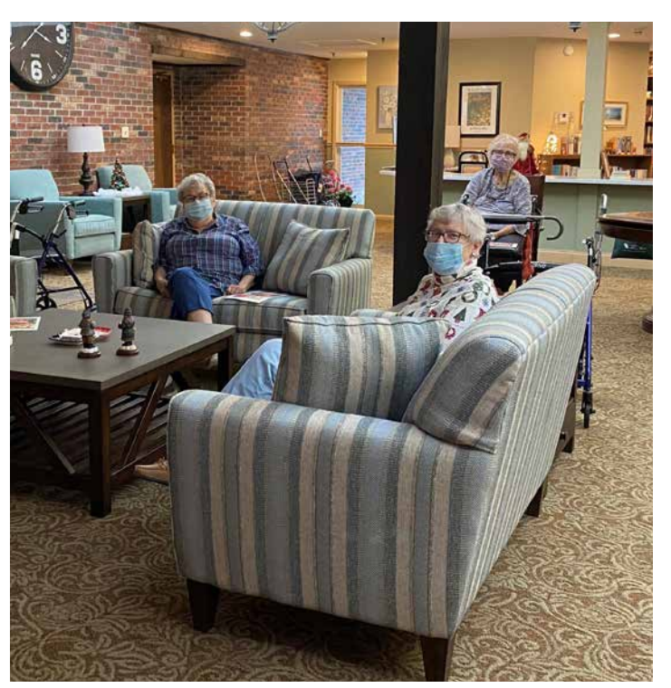
Great conversation on comfy couches