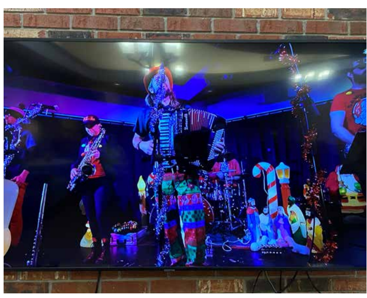
The Chardon Polka Band