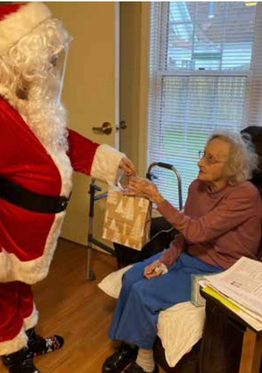
Kensington residents are thrilled with Santa's visit and the wonderful gifts!