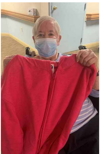
Wow, look what I got!