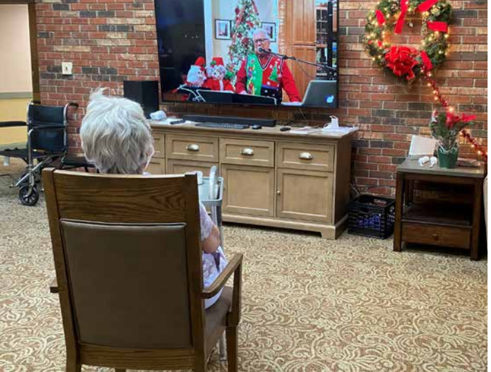
Plenty of room in Norwood "A" for social distancing!