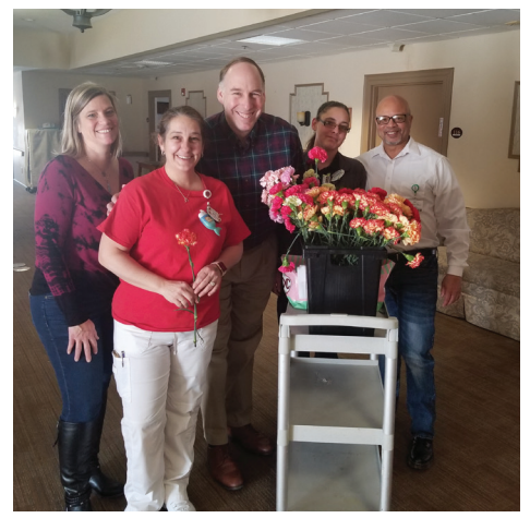
Ready to rock and roll!