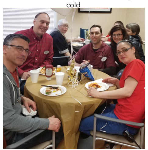
Enjoying a great lunch