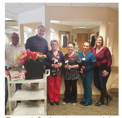
The crew in Southwest is very appreciative