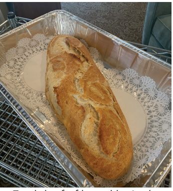
Fresh loaf of bread lovingly made by Izolda at Atrium