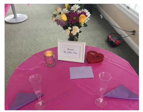
Be Our Guest!

Along with the aroma of a most delicious lunch! To help make Valentine's Day a bit more romantic for our married residents, the dining rooms of Anna Maria and Kensington were "transformed" into a romantic restaurant, where our couples enjoyed a bit a pure romance, along with a most delicious lunch. A bit of bubbly, flowers, candles, and music added to the intimate atmosphere. Sparks were flying! Many thanks to our wonderful activities and dietary departments for their assistance in making certain every detail was perfect!