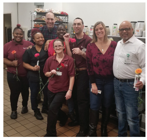
The dietary staff