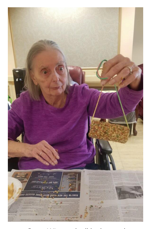
Grace W's seed roll looks good

What does one do with empty toilet paper rolls? Why, smear with peanut butter and sprinkle with bird seed, and hang out side for our feathered friends. Always looking out for our feathery friends.